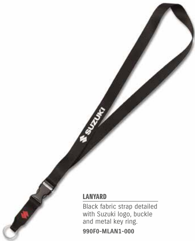
LANYARD Black fabric strap detailed with Suzuki logo, buckle and metal key ring. 990F0-MLAN1-000