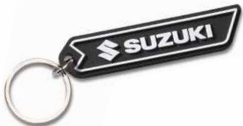
KEY RING BLACK Black and white, PVC. 990F0-MKEY1-000