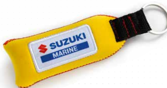
MARINE FLOATABLE KEY RING Signal yellow floatable key ring, neoprene outer material, useful for max. three stand- ard keys (max. 40 gr. total). 990F0-SMFK1-000