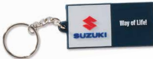
“WAY OF LIFE” KEY RING Takumi colour and white, PVC. 990F0-WAYOL-KEY