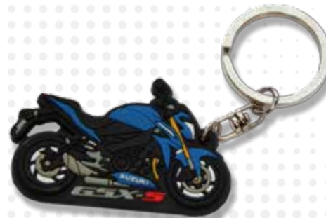
GSX-S1000 KEY RING Black and blue, PVC. 990F0-GSKE1-KEY